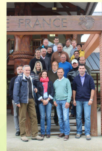
FEI Level 3-Course for Course Designers, Lamotte Beuvron/FRA 19.-24.10.2015

The hotel of the park offers comfortable 3* appartements, very calm and with view on the park.